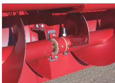
Wood block hanger bearings