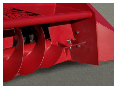
Heavy duty 4-blade flipper