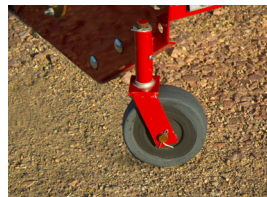
Optional swivel end wheels