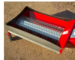
Wide hopper with flex skirt