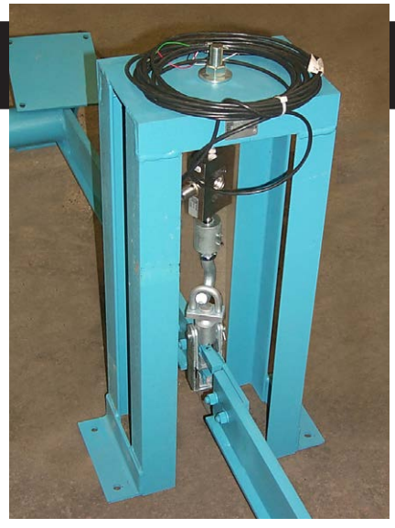
Scales are NTEP approved

Certification is required for "legal for trade" use.