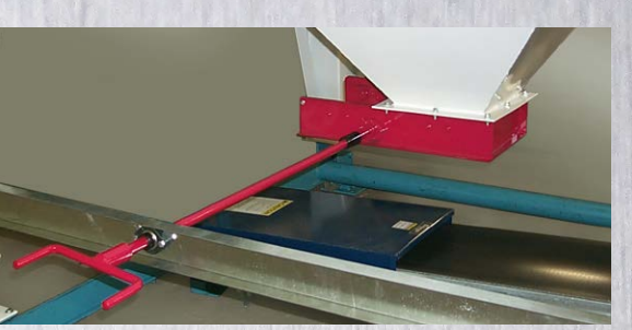
The rack & pinion gate has an extended control rod for easy operation.