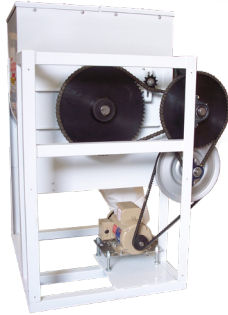
Guarding removed for illustration purposes.