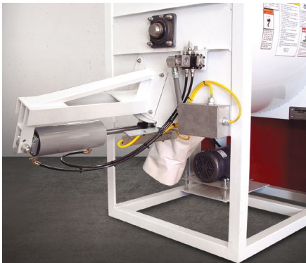
Optional pneumatic gate control