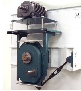
Torque arm reducer drive for M4000 and M6000 mixers. Belt guard is removed for illustration purposes.