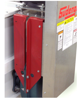
Screw conveyor drive for M1000 and M2000 mixers